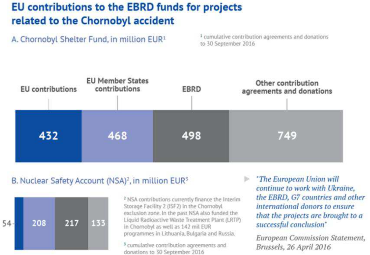
Figure 3: Major funds with contributions by EU, Member States, EBRD and other donors

With respect to policy and political engagement, the INSC has an important part in enabling the EU to play a leading role in the follow-up on challenges and initiatives identified in the G7 Nuclear Safety and Security Group. As demonstrated by interventions under both INSC-I and INSC-II, the Instrument gives the EU the opportunity to lead cooperation on nuclear safety, by providing swift reactions to be carried out within a concerted political and policy effort, In specific cases the Instrument demonstrated that it works as a door-opener for political engagement. For example, it helped obtain the engagement of Iran on a comprehensive cooperation on civil nuclear safety, once the international agreement on the Joint Comprehensive Plan of Action was reached. The policy dialogue is supported by sound coordination between Commission services, the Joint Research Centre, and the European External Action Service.