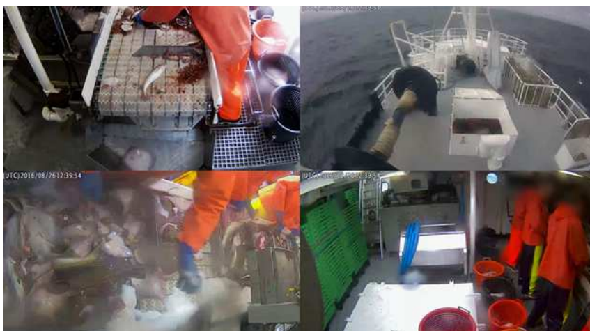
Cameras are positioned so that they only record the catching or sorting activities.

When it comes to anonymisation, technological solutions can deliver on personal data protection at the recording stage. Software solutions exist today that are capable of irreversibly anonymising the individuals operating in the monitored areas at the time of recording, for instance, by means of pixelation. 16 According to technology companies providing CCTV recording services for fisheries, improved machine learning will, in the near future, further improve the technological anonymisation solutions offered to protect the data privacy of crew members. 17