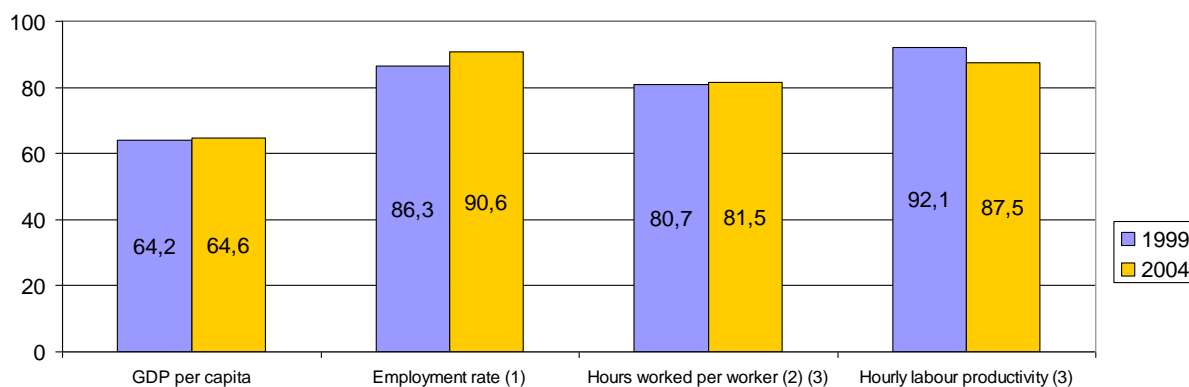
Graph 1: European Union performance 1999-2004 (US=100) (4)

Considering the enlarged EU of 25 Member States, GDP per capita stands at around 65% of the US level with no significant improvement since the launch of the Lisbon strategy. In the first half of the decade, it has not been possible to complement the relatively positive developments in terms of employment creation with the required acceleration of productivity growth (see graph 1).