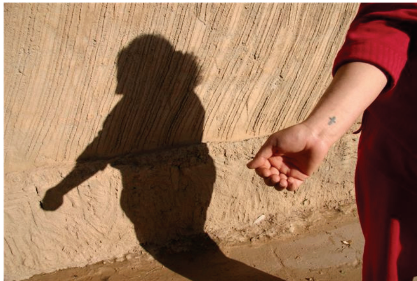
A Christian woman from Baghdad living near Arbil displays her crucifix tattoo. Like hundreds of Christians from the capital, she and her family fled to northern Iraq for safety from threats and attacks.

The most public and coordinated attacks took place on Sunday, August 1, 2004, when insurgents detonated car bombs at five churches, four in Baghdad and one in Mosul, killing eleven people and wounding more than forty. The attacks sparked an exodus of Christians to Syria, Jordan and the Kurdish-controlled north.