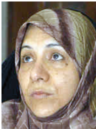
Iraqi Governing Council member Salama al-Khafaji in her Baghdad home on May 28, 2004. The day before, unidentified assailants ambushed her convoy south of Baghdad, killing her bodyguard and eldest son. “It’s the women who have suffered the most under this occupation,” she told a journalist. “And that’s why it’s women who want peace the most.”

At least four prominent women politicians and government officials have been targeted between March 2003 and July 2005—Aqila al-Hashimi, Salama al-Khafaji, Nasrin Barwari and Lamia Abid Khaduri al-Sagri (al-Hashimi and al-Sagri died)—although they were most likely attacked because of their political activity rather than gender (see chapter VI of this report, “Attacks on Government Officials and Politicians”). Attacks on lower-ranking women officials, however, seem to have been motivated by their work on behalf of women.