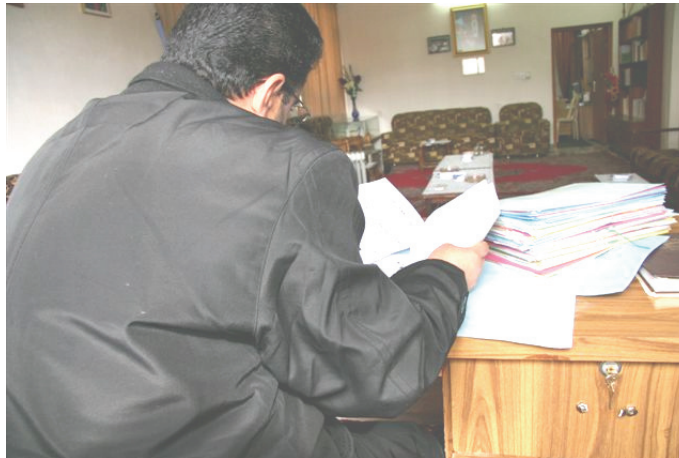
A priest in Sulaimaniya reviews letters from Christians all over Iraq seeking help in relocating to the Kurdish-controlled north to escape threats and attacks.