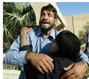
A mother hugs her son outside a morgue in al-Najaf. Two car bombs exploded on August 29, 2003, killing up to eighty-seven people, including Ayatollah Muhammad Baqir al-Hakim.

A second targeted category is Iraqis who work for foreign governments or their armed forces as reconstruction contractors, translators, cleaners, and drivers or in other non-combatant jobs. Some insurgent groups consider Iraqis in these positions to be collaborators, and attacks against them are apparently meant as punishment and as a warning to others. In one case documented in this report, gunmen killed three women as they left a U.S. military base in Mosul where they worked as cleaners, and attacks like this have been frequent across Iraq.