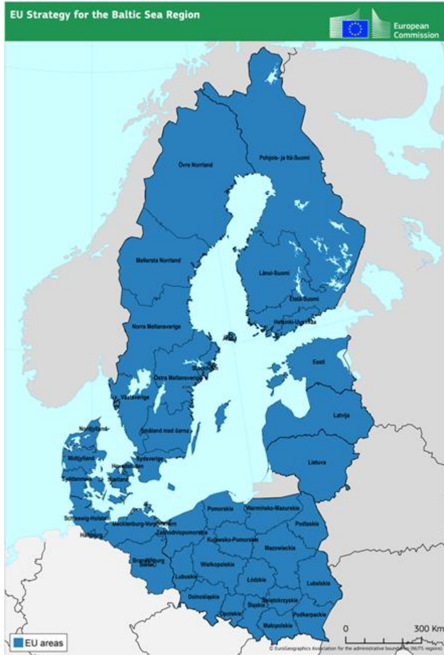
Annex 1: map of the EU Strategy for the Baltic Sea Region