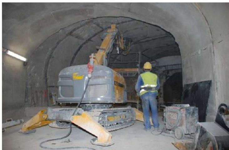
Figure 2: Example of NRMM without on-board power source: concrete spraying machine used in mining

Relevant product groups for the latter include professional cleaning machinery (see Figure 1) and certain types of construction or mining machinery (see Figure 2 and Figure 3).