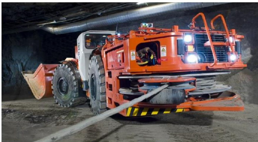
Figure 3: Example of NRMM without on-board power source: a wheel loader used in mining

The current NRMM definition would thus lead, after 22 July 2019, to a situation resulting in very similar types of equipment being regulated differently and inconsistently.