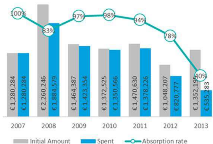
Figure 2 Initial procurement amount committed, paid and absorption rate across the period 2007-2013 by 31 March 2017

Source: ICF analysis of DG Budget ABAC data.