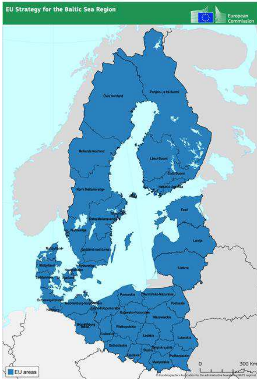
Annex 1: map of the EU Strategy for the Baltic Sea Region