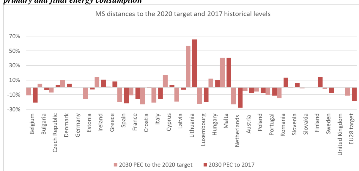
Figure 2 and 3: Differences of the 2030 contributions from the 2020 targets and 2017 data, for primary and final energy consumption