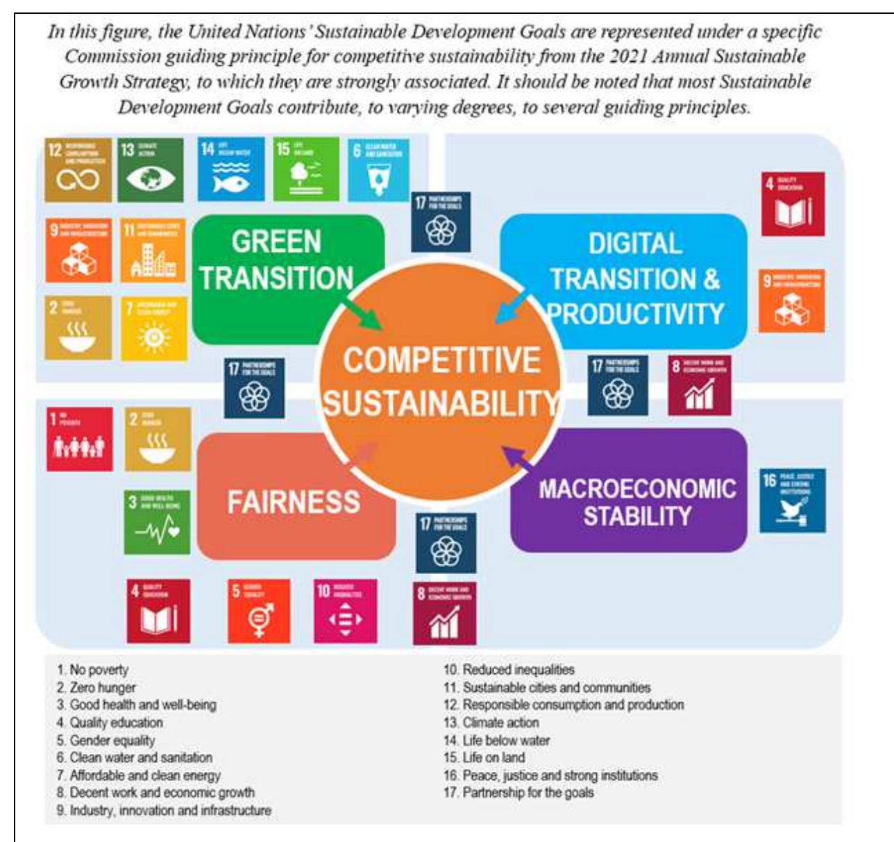
Box 1: Progress towards the Sustainable Development Goals

The objectives of the Sustainable Development Goals (SDGs) are integrated in the European Semester since the 2020 cycle. This provides a strong commitment towards sustainability in coordination of economic and employment policies in the EU. In that respect, this section outlines France's performance with respect to Sustainable Development Goals with particular relevance for the four dimensions underpinning the recovery and resilience plans (green transition, fairness, digital transition and productivity, and macroeconomic stability), indicating possible areas where investments and reforms in line with the objectives of the Facility could further accelerate the progress on the Sustainable Development Goals.