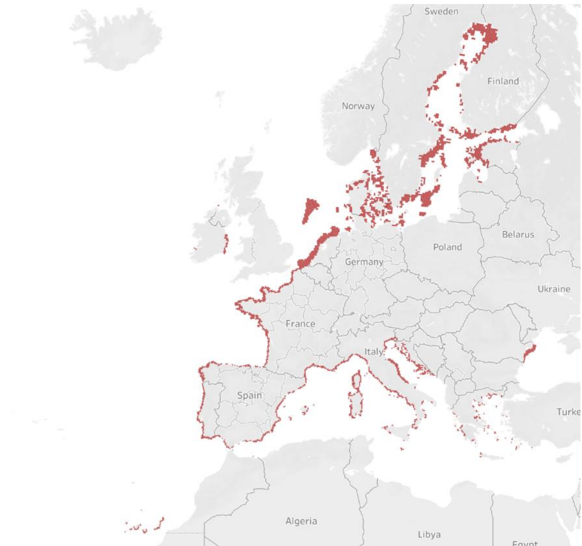
Map 2 – Distribution of habitat 1110 – Sandbanks which are slightly covered by sea water at all time