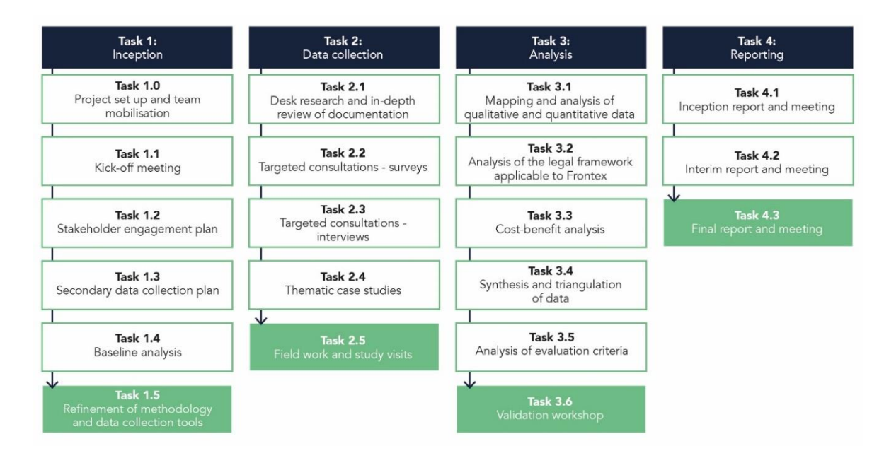
Figure 1: Overview of the methodological approach

The supporting study, conducted by the external contractor was guided by a methodological approach, which was divided into four tasks, in line with the original ToR: 1) Inception; 2) Data collection; 3) Analysis; 4) Reporting.