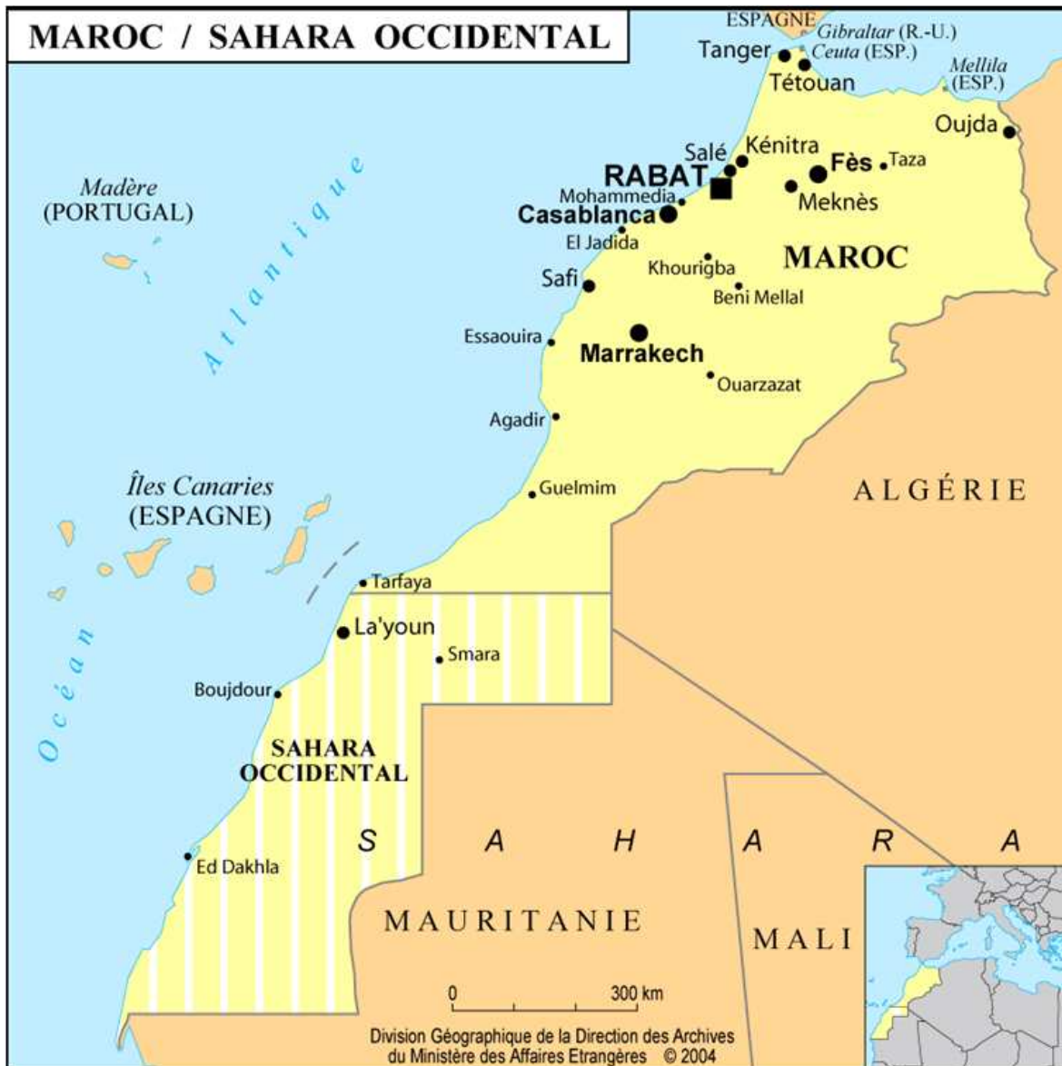
Figure 1: General map of Morocco and the Western Sahara.

Morocco, officially the Kingdom of Morocco, is a country located in North-West Africa and belonging to the Maghreb. Its political capital is Rabat, whereas its economic capital and largest city is Casablanca. The country is bordered by the Atlantic Ocean to the west, Spain, the Strait of Gibraltar and the Mediterranean Sea to the north, Algeria to the east and de facto by Mauritania to the south, beyond the Western Sahara which is in dispute. The country covers an area of some 710 000 km 2 , of which 252 000 km 2 in the Western Sahara.